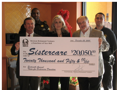
(Back row): Richland County Sheriff's Department deputies

Funds donated from TACO BELL will go toward emergency shelter and counseling for battered women and their children in the South Carolina Midlands community. Muchas gracias, amigo bueno, TACO BELL!